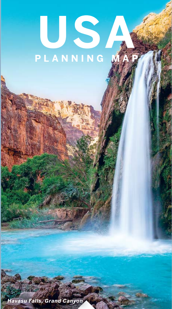
Havasu Falls, Grand Canyon

Discover the USA's top regional sights, and experience it through an inspiring list of themes