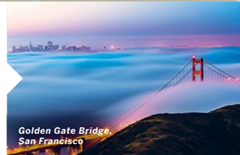
Golden Gate Bridge, San Francisco

A cutting-edge Pacific Rim city with the uncanny habit of turning locally hatched ideas into global brands, Seattle has a world-renowned music scene, mercurial coffee culture and a penchant for internet-driven innovation.