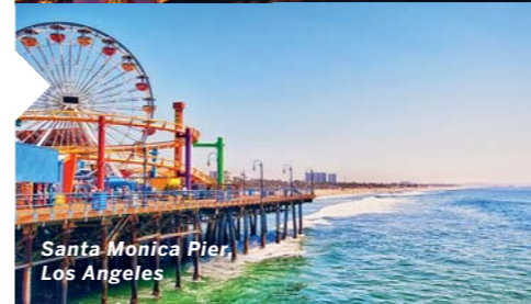
Santa Monica Pier, Los Angeles