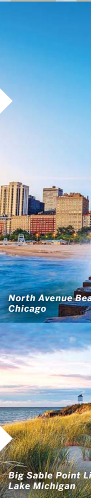
North Avenue Beach, Chicago

This region is off-the-beaten-path touring: intrepid outdoors folk can wet a paddle in Minnesota's Boundary Waters or trek to Michigan's Upper Peninsula. At night sleep under a blanket of stars to the lullaby of wolf howls.